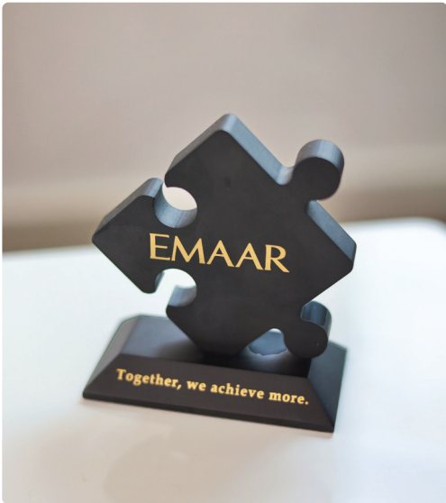
Emaar Alliance Award 2024