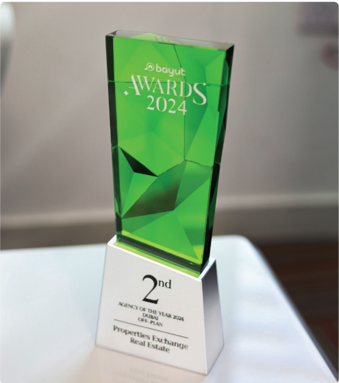
Top 5 UAE Brokerages (2024 & 2025)

Ranked among the nation's best performers