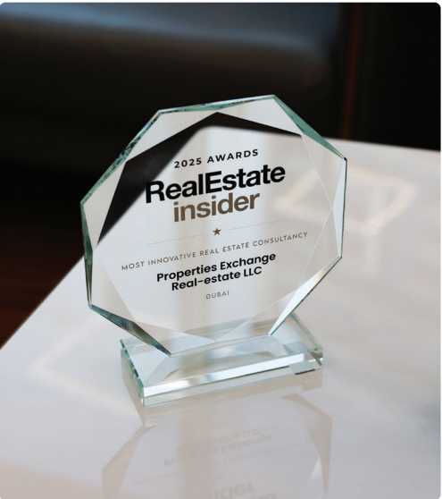
Most Innovative Real Estate Company 2025

Ranked among the nation's best performers